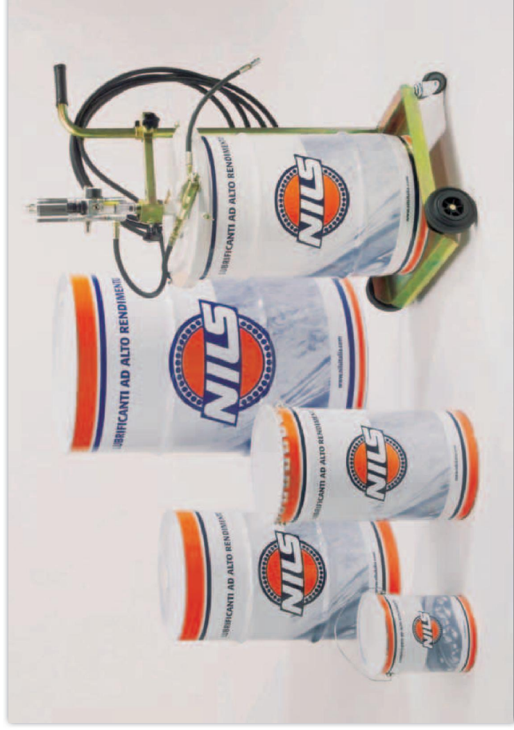
PA 50 - Pneumatic pump set

Complete set for 50/60 Kg drums contains: